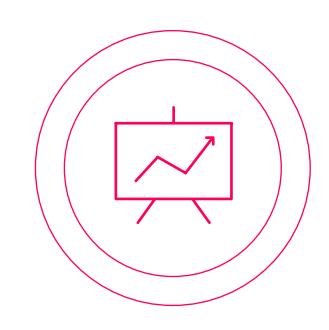
Increase in retention of a month-to-month paying user