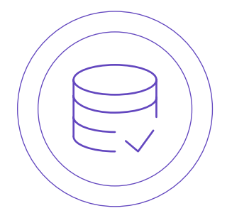
Consolidated siloed tech stack on one platform