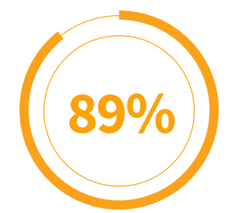
User engagement with videos

Fender has inspired millions of people to learn to play guitar. However, for most aspiring players, the initial burst of inspiration fades quickly—90% of first-time players quit within six months. This retention problem led Fender to begin investing in digital properties four years ago. The company now has three different mobile apps—Fender Play™, Fender Tune™, and Fender Tone™—as well as a direct-to-consumer business and e-commerce platform; however, the majority of its business is done with local musical instruments dealers around the world.