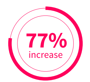
4Q17 sales attributable to ad hoc email using data feeds