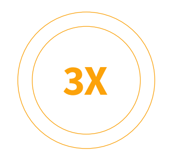
Revenue from email and push

The old tools were also cumbersome to use and offered limited functionality. Worse yet, they didn't support the team's Al driven, omni-channel marketing strategy, which includes reaching customers through SMS, in-app messaging, and social media.