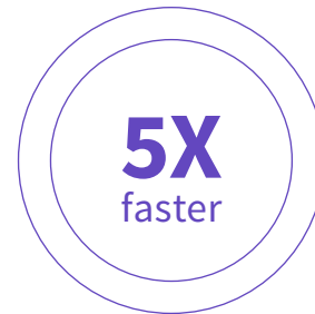
Translation of campaigns leveraging an Iterable integration with Box