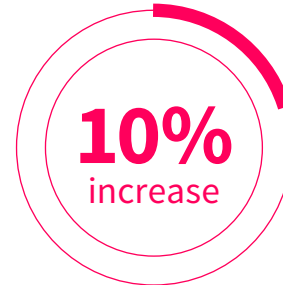
In user adoption