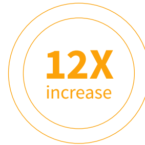
In users Box can reach

The expansion required scaling up Box's customer communications capability from tens of thousands of administrators to tens of millions of end users.